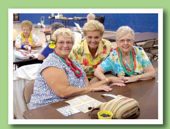
Come on!!!! Play BINGO with us!!!!!

Bingo is held every Monday at the Community Center located at 16553 S. Haven Avenue from 12:00pm – 2:00pm. Come join the fun with our lively group of current members and become part of the Orland Hills Senior Club. This popular social opportunity offers seniors a place to gather and make new friends. This program focuses on not only bingo, but important informational topics, fitness and special events. Stop by any Monday and enjoy some bingo, refreshments and a possible cash prize if you're the lucky winner!