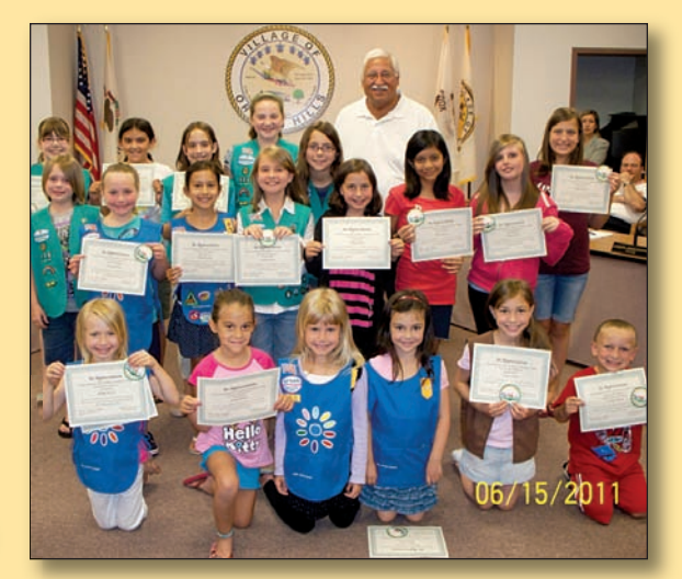
What an awesome group photo!